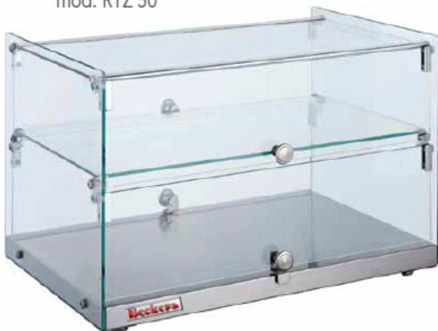
mod. RTZ 50