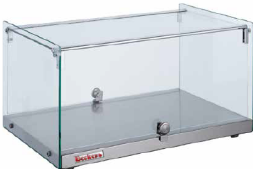
mod. RTZ 35