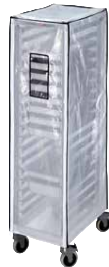
GBCTUGNPR11 Optional Heavy Duty Vinyl Cover for GN 1/1 Full Size Trolley.

All Trolleys ship knockdown (KD) complete in 1 box with casters and bottom frame wedges factory assembled on posts.