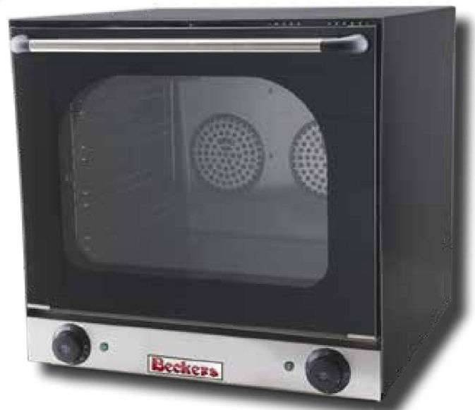
mod. S1 ECO